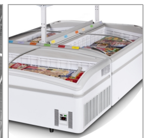
Island installation, shelves as accessory