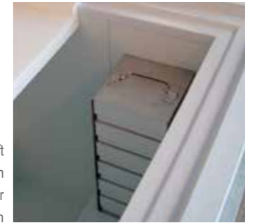
Inner lids (left hand side) which are mandatory for optimized function